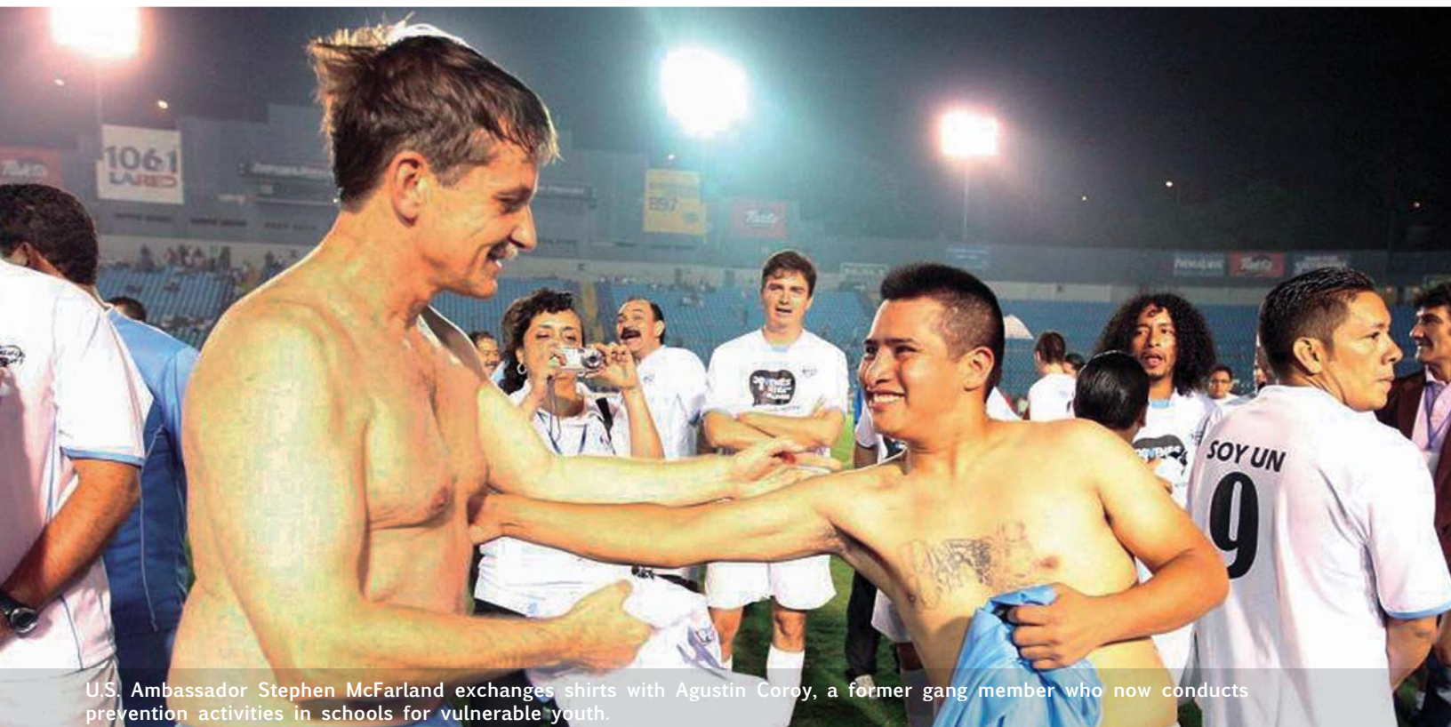
U.S. Ambassador Stephen McFarland exchanges shirts with Agustin Coroy, a former gang member who now conducts prevention activities in schools for vulnerable youth.

A crowd of 10,000 turned out to cheer as 15 former gang members spilled out onto Guatemala's Mateo Flores National Stadium to face a team of government officials including the Chief of Police, the Minister of Culture, the Presidential Sports Commissioner, police officers, firemen, and two Armed Forces Generals in an historic soccer match. The event kicked off a multi-faceted "90 Minutes Against Violence" campaign ultimately aimed at engaging Guatemalan youth in making specific recommendations for reducing violent crime.